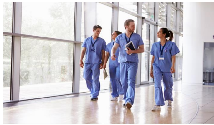
Table and Program Sponsorship Opportunities

Saturday, November 11, 2023 Renaissance St. Louis Airport