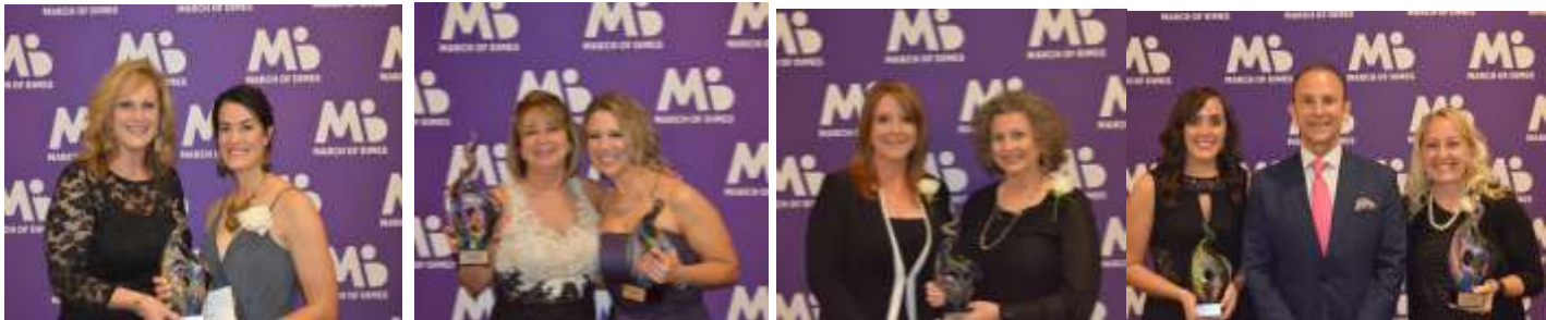
Images from the 2018 Oklahoma Nurse of the Year event.

Nurses are nominated by peers, managers, supervisors or even the families they have impacted. Each nomination is carefully reviewed and scored by a committee of CNO’ s and Nurse Educators and other leaders from the community.